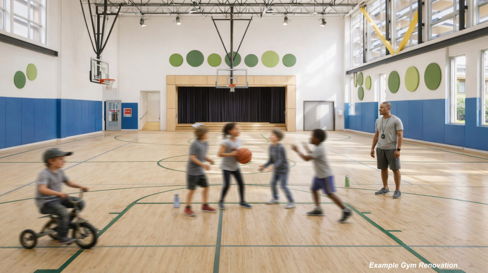
Example Gym Renovation