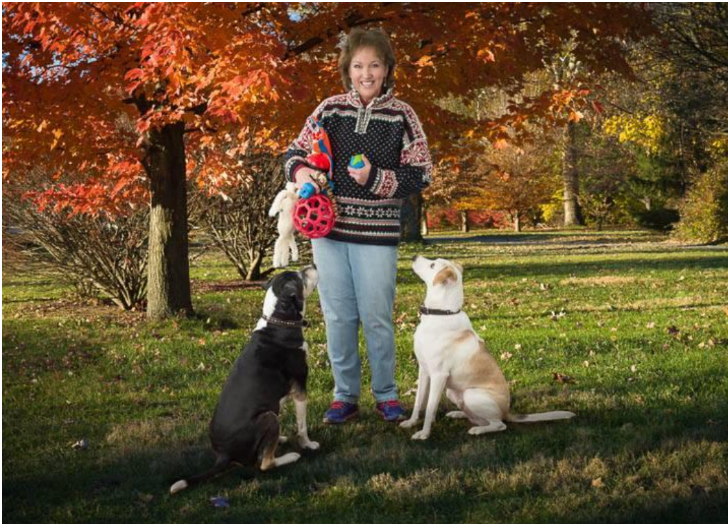
Kirrie and Murrie know that fun lies ahead! It is through consistent playful interactions that they know what to expect.

way during therapy sessions. Training not only teaches dogs some new behaviors, it also teaches us as we improve our handling skills and ability to communicate with our dogs. Those abilities are ones we carry with us into the therapy room, just as our dogs do! It behooves us to interact with our dogs at all times in ways that are likely to build pleasant, mutually beneficial relationships where the genuineness of caring for each other shows in practically everything we do.