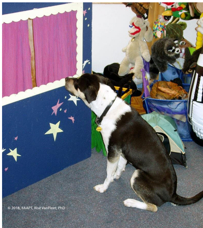
This is another example of a dog who is fully engaged and interested in what will happen next with the client.

Training approaches that focus on antecedent conditions (arranging things to set the dogs up for success) and the use of positive reinforcement (to let the dogs know that they are doing well so they will continue that desired behavior) help learning remain fun for both dogs and their humans. When learning is fun, the dogs show it in their demeanor as they eagerly approach new tasks.