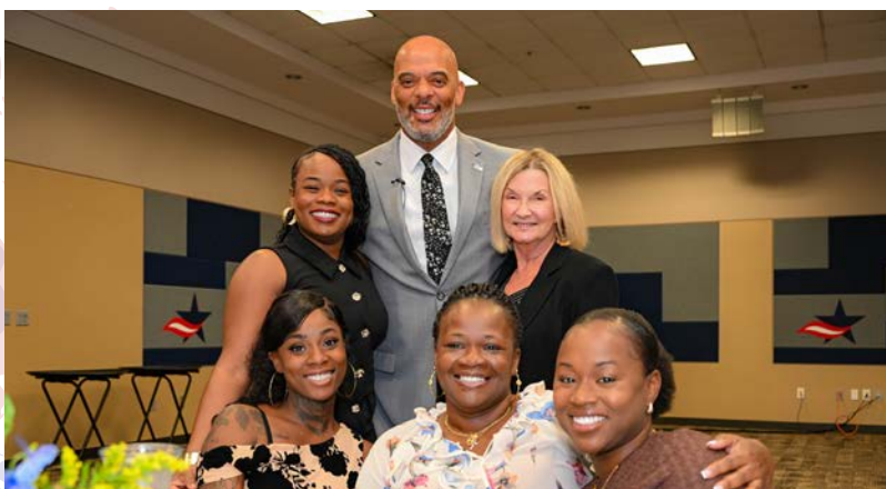
The fourth annual Celebration of Excellence honored 41 HCDE employees across the five instructional divisions and Employees of the Month.