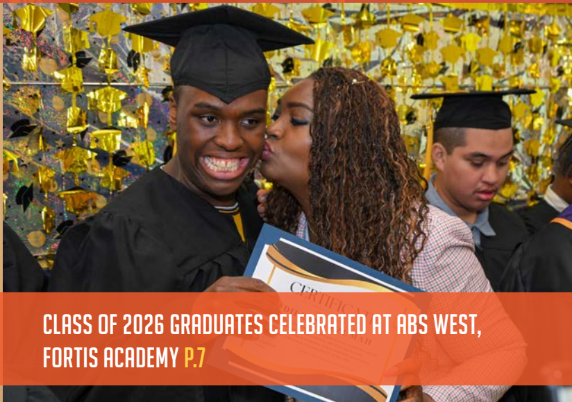
CLASS OF 2026 GRADUATES CELEBRATED AT ABS WEST, FORTIS ACADEMY P.7