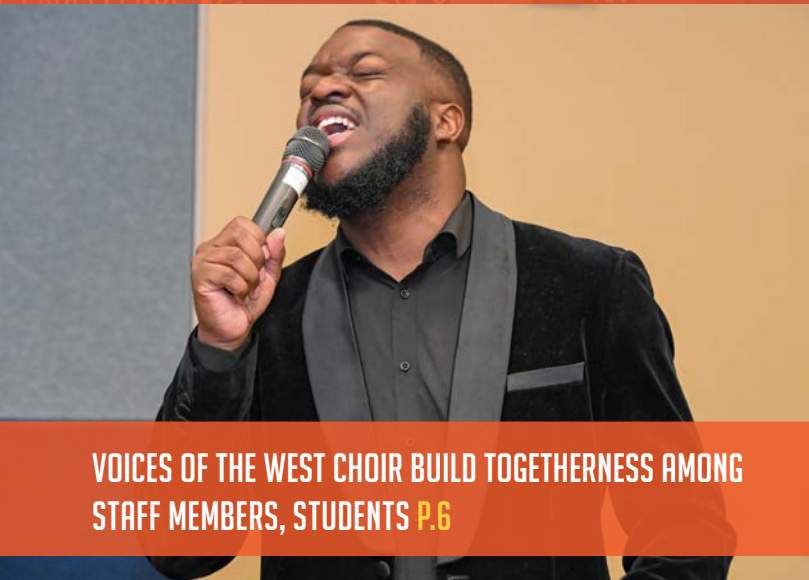
VOICES OF THE WEST CHOIR BUILD TOGETHERNESS AMONG STAFF MEMBERS, STUDENTS P.6