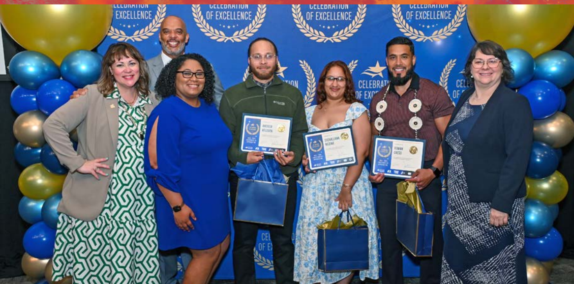
Celebration of Excellence award honorees from the Center for Afterschool, Summer and Enrichment for Kids pose for a photo with members of the HCDE leadership team. The staff recognition event honored employees from HCDE's five instructional divisions as well as the Employees of the Month during the 2025-2026 school year.

WHETHER IT'S SPEAKING TO STAFF or community partners regarding our organization, one consistent thought I've always shared is Harris County Department of Education is the best place I've worked. A big reason is due to all the dedicated employees. From #TeamHCDE working with students at the Head Start campuses, four Special Schools and the Adult Education Learning Center, to our many School-Based therapists and CASE for Kids site and program coordinators across Harris County, to talented individuals within our support divisions providing services to our employees. At the annual Celebration of Excellence, leadership congratulated and recognized our exceptional team members and honored them for their outstanding work. This event highlights the contributions from staff members across HCDE's five instructional divisions in addition to recognizing the Employees of the Month from the past year. What makes the event more meaningful is that the room is filled with family members and colleagues beaming with pride for their loved ones and teammates. I am thankful to all the honorees for being the standard bearers for this outstanding organization.