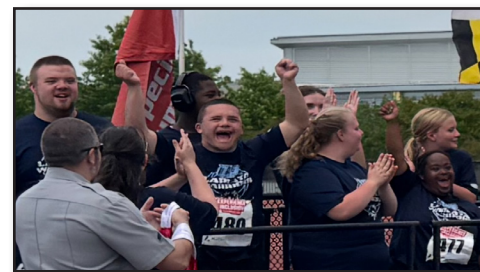
Members of La Plata High School's Unified track and field team celebrate a first-place win at the state championships.

She has coached La Plata's Unified bocce and track and field teams for years. "Unified sports provide students with meaningful op-