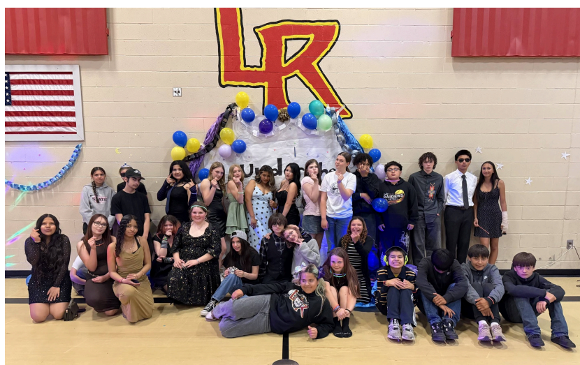
Junior High MORP Dance

6/11: 8th Grade Recognition at 9am, LRHS Gym