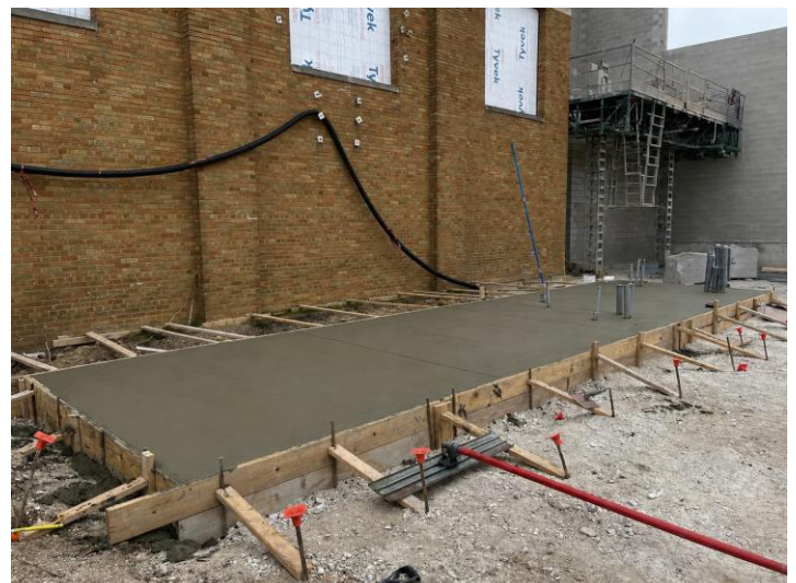
Generator Pad – North Side Area A