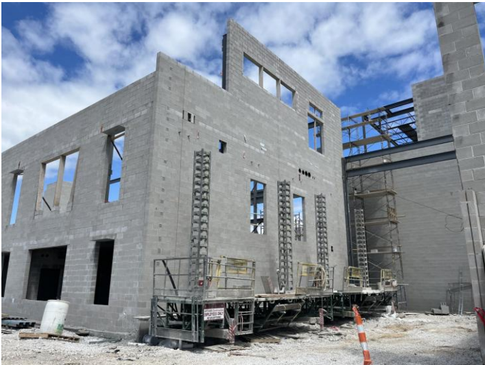
3-Hour CMU Wall – Main Entry