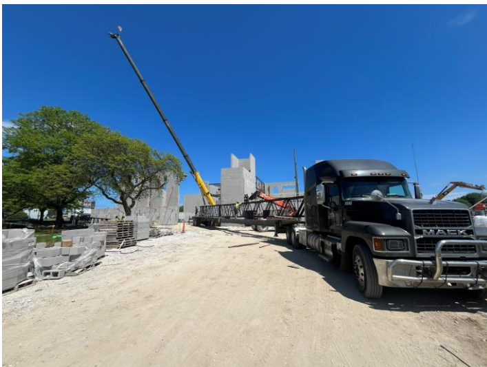
Long Span Joist Delivery – Area C2