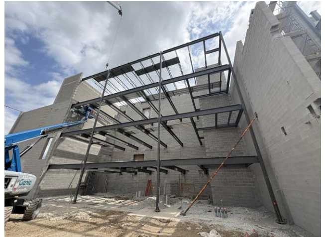
Structural Steel Installed – Area A2