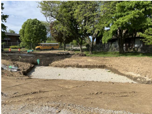
Site Storm Excavated – South View