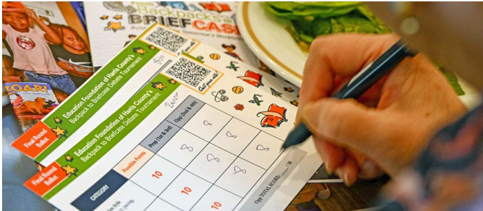
Luncheon attendees were tasked with judging a mock debate. Spring Branch ISD students from the CASE Debates program spoke on the importance of investing in EFHC and life-changing opportunities made possible through community support.