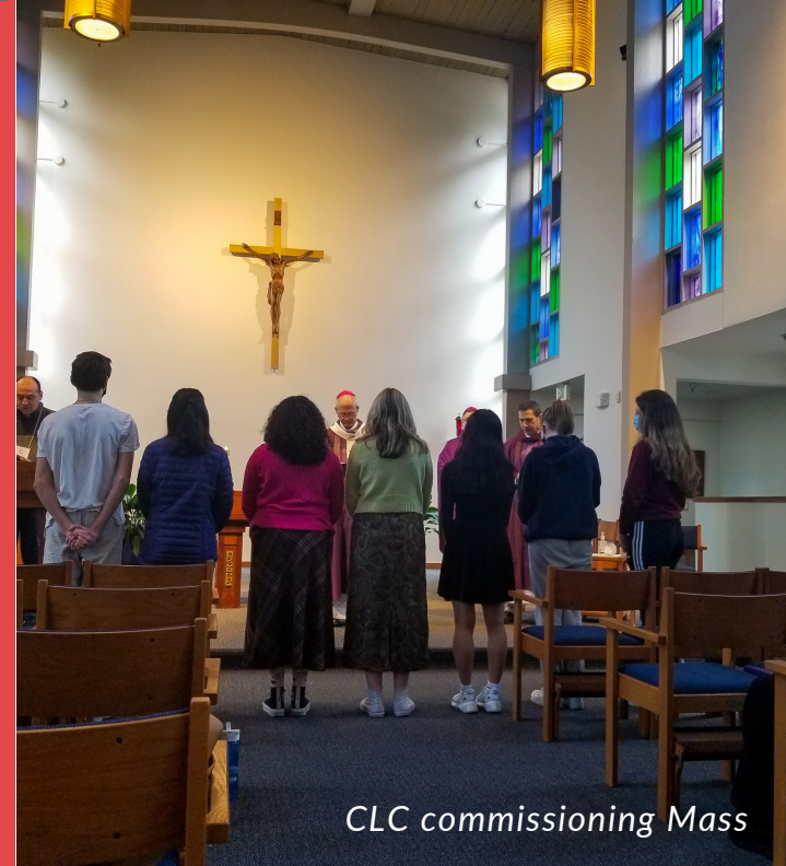
CLC commissioning Mass