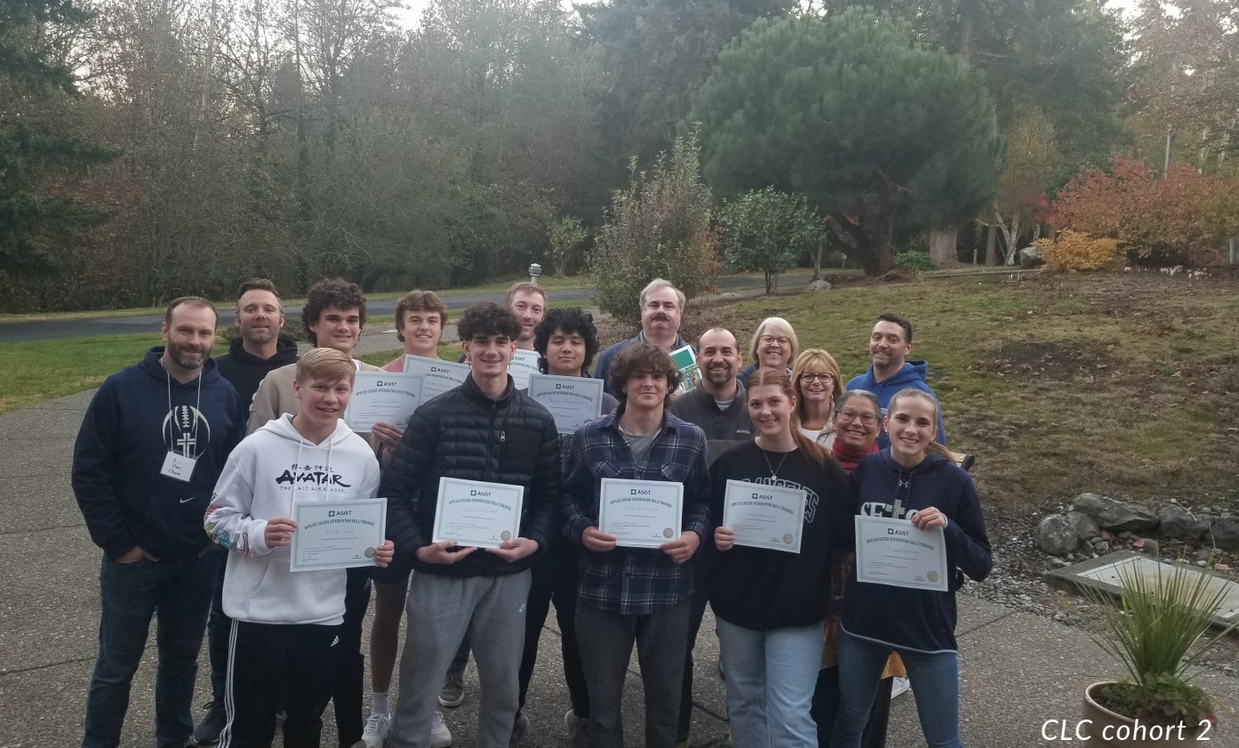
CLC cohort 2