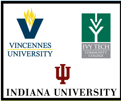
Higher Ed Partners

Shoals High School, also known as the Mighty Jug Rox, with approximately 200 students, is always seeking ways to expand opportunities for students. We like to say we are small but mighty. We currently offer the Indiana College Core to provide our students with the opportunity to complete their first college year. We are continuing to implement additional pathways for our students to have access to, especially the Associates degree. Thirty-one early college courses are offered for students to get a head start and to save money.