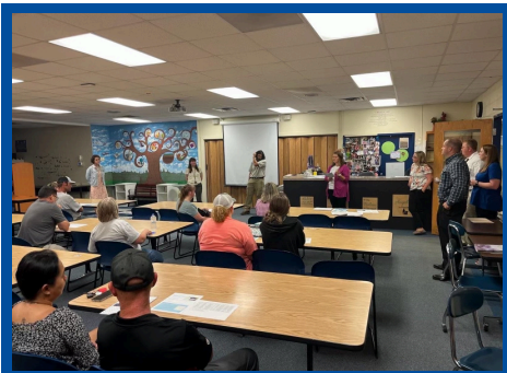
EC Parent Night