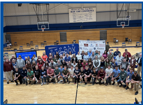
Senior Decision Day and Mock Interviews