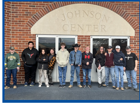
College and Career Visits