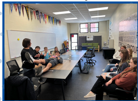
College and Career Speakers