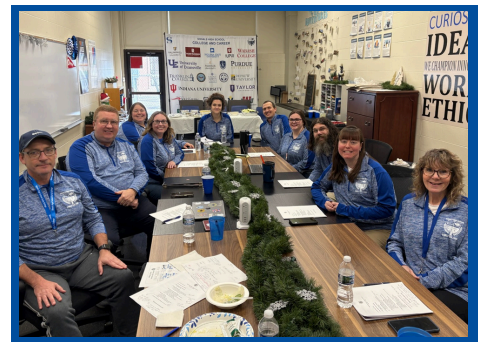
Early College Teacher Meetings