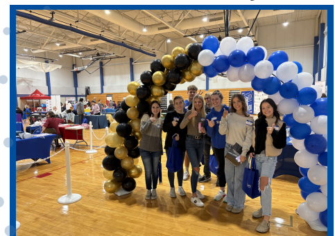
College and Career Fair