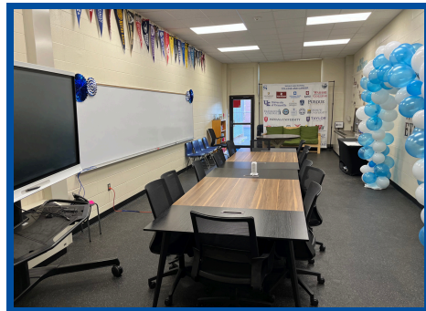
Dedicated Early College Room