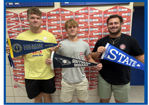
College GO! Week