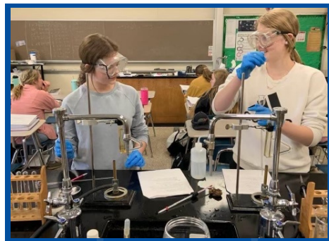
31 Early College Courses/ Indiana College Core