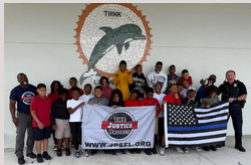
Always a great moment investing in young boys.