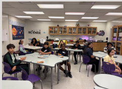
Take Your Child to Work Day!