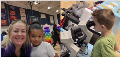
MLE students had a lot of fun at Plantation High School for their hands on and engaging centers for Science Night 🦋