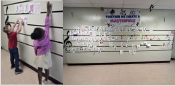
School wide Autism Acceptance project!