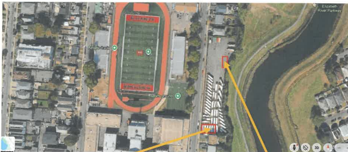
Charger Location B