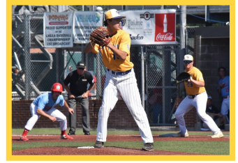
June 15-19: Baseball