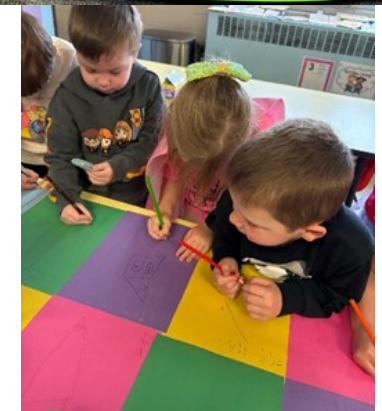
HAVING FUN WITH FRIENDS!