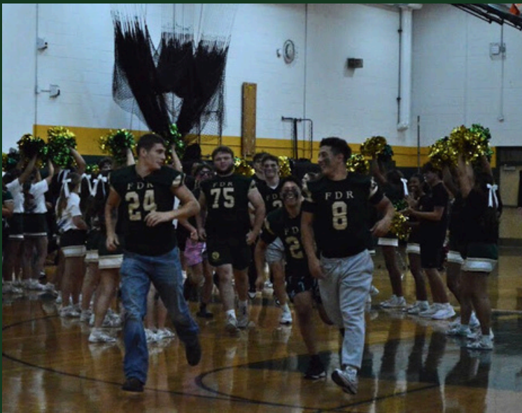
Sept. 26, 2025. Varsity Football running through a tunnel of cheerleaders as the final team announced.