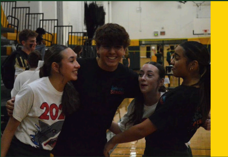
Sept. 26, 2025. Varsity cheerleaders laughing before an exciting afternoon at the pep rally.