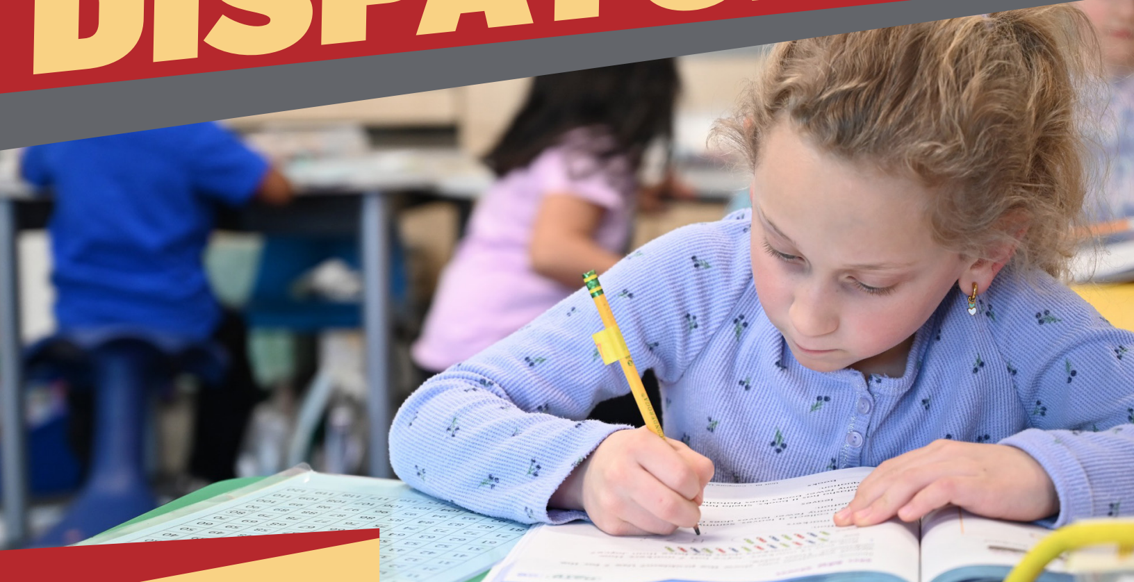
A look at math class at Mendota Elementary: first graders practice regrouping using a variety of strategies to build confidence in two-digit addition.

School News & Updates for the School District 197 Community Spring 2026