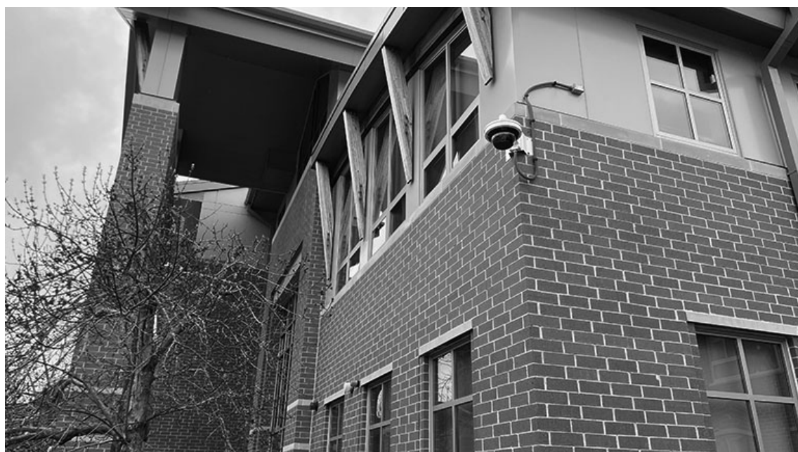
The school’s new security cameras, including the ones by the front entrance, above, and the student lot, below, were updated and have a live feed and an archive with over one year of storage.

She said the police department has accessed the footage for investigative purposes, including two incidents roughly two years ago.