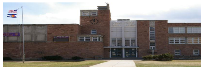
Boulder High School ~ A Place for Everyone Est. 1875