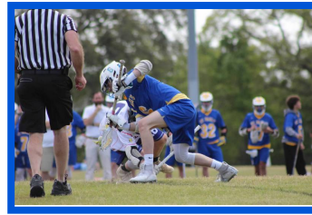
July 13-17: Lacrosse