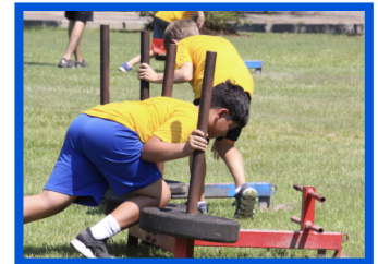
July 6-10: Speed, Agility, and Strength