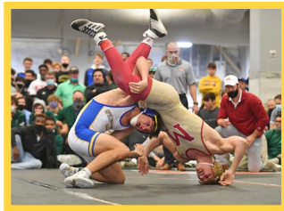
July 13-17: Wrestling