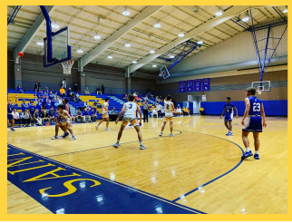
June 1-5: Basketball