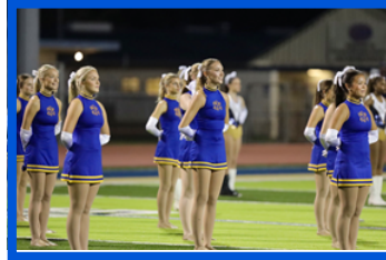
June 1-5: Dance (girls only)