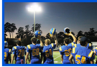
June 8-12: Football