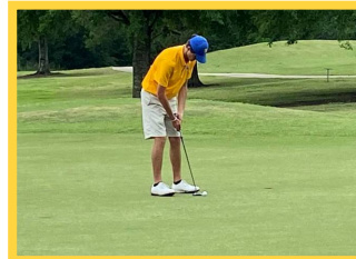
June 22-26: Golf