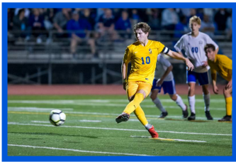
June 22-26: Soccer