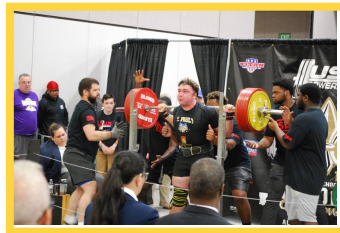
June 22-26: Strength