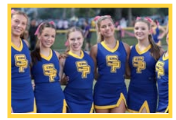
July 20-24: Cheer (girls only)