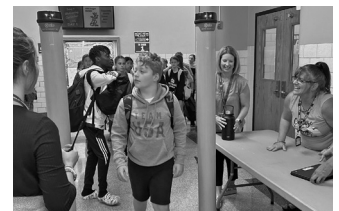
Students take part in daily OpenGate screenings at middle/high schools.

This year also began with a new model for security personnel. Each of 10 schools now has one armed officer through the district's partner, the Tarian Group, each and every day. All Tarian officers are highly trained retired law enforcement. Additionally, new unarmed Security Officer positions were created during the school day. This includes a Senior Security Officer to