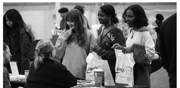
Ken-Ton high school students engage with local business representatives.

Throughout the day, students participated in interactive sessions covering essential topics such as how to start a business, how to present themselves professionally in the workforce, effective study strategies, and careers in civil service fields.