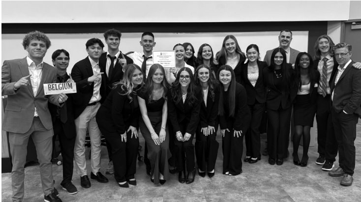
Kenmore East Model United Nations Team

These are just some of the many achievements and accomplishments of students and staff over the past year.