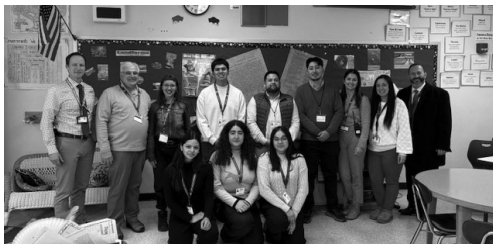
Student teachers from Chile visit Hoover Middle.

The student teachers spent time shadowing several Hoover Middle teachers,