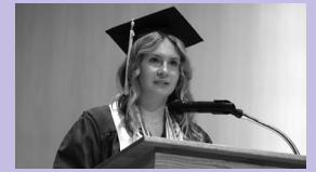
Scenes from the Big Picture, Crossroads Academy, Kenmore East, and Kenmore West graduation ceremonies