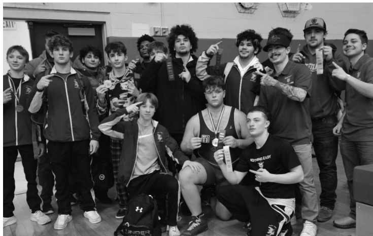
Kenmore Boys Wrestling Team