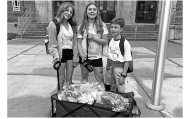
Clockwise, from top left, students make Valentines at Franklin Elementary; the Purple Pinkie Project; “Kindness Projects” at Hoover Middle; and “Birthday Bags” at Hoover Elementary.

reopening of the historic DL&W metro rail station at Canalside and Ken-Ton’s Memorial Day ceremony.