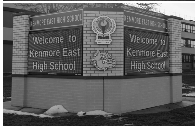
Above, the new lights at the athletic field; below, the new electronic sign.