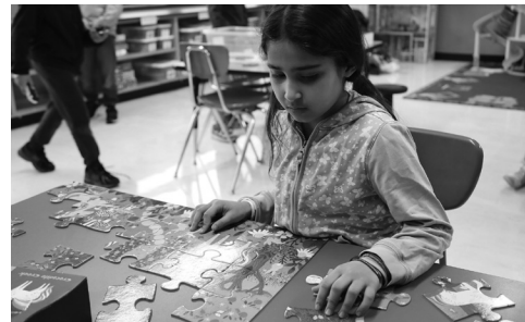
A student enjoys a puzzle in the Recess Room.

Teachers have the option of reserving the room throughout the school year. With recess included each school day for 20 minutes for all students in Gr. K-4 across the district, it gives students the opportunity to have fun, practice and learn social/play skills, recharge, and unwind no matter the weather.