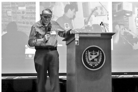
Edward Gibson speaks at Kenmore West.

In 1965, Mr. Gibson was chosen as part of the NASA Astronaut Group 4, the first-ever group of scientists selected to be astronauts. He served on the support crew of Apollo 12 and as the science pilot aboard Skylab 4, the final mission to America's first space station.