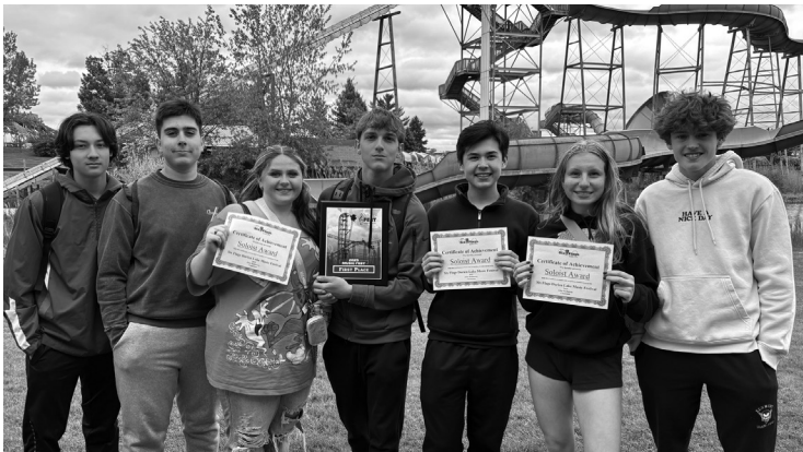
Kenmore West Band students at the Darken Lake Music Festival