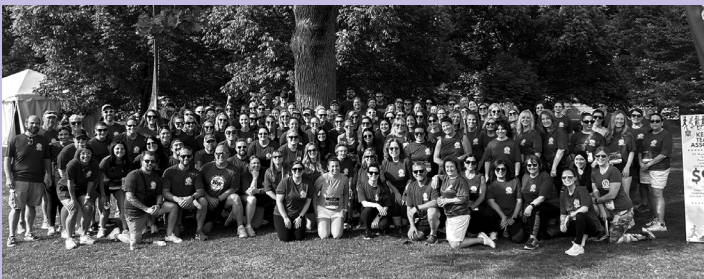
The Ken-Ton School District 2025 Corporate Challenge Team.

The progress being made in schools wouldn't have been possible without everyone's hard work including teachers, administrators, students, and families.