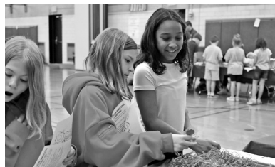
Franklin students learn about different professions at the recent Career Day event.

Fields included nursing, paleontology, law enforcement, graphic design, photography, home improvement, bus drivers, and librarians. Special thanks go