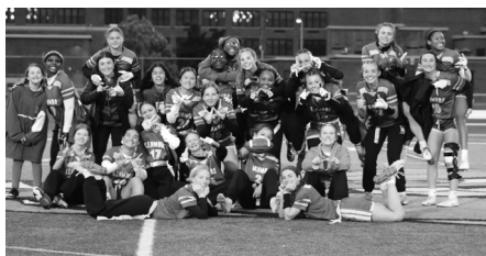
Kenmore Girls Flag Football Team