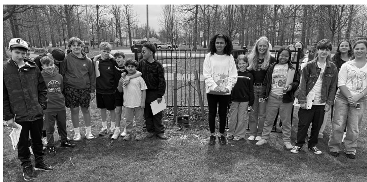
Franklin Middle students pose by the school's Moon Tree.

This was done in the vicinity of the school's moon tree which was grown from a seed that flew aboard the unmanned Artemis I mission in 2022. It was in large