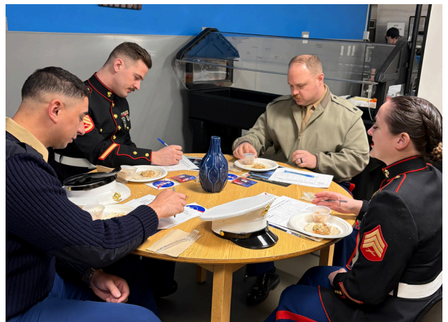
Local military recruiters and veterans were served by students and enjoyed the Tex-Mex taco recipe for lunch at the Culinary Café on TCCC campus before heading to national competition.