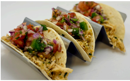
Jessalynn's "Texi-Mexi" Chicken Taco pictured here ready to enjoy and processed for space flight!