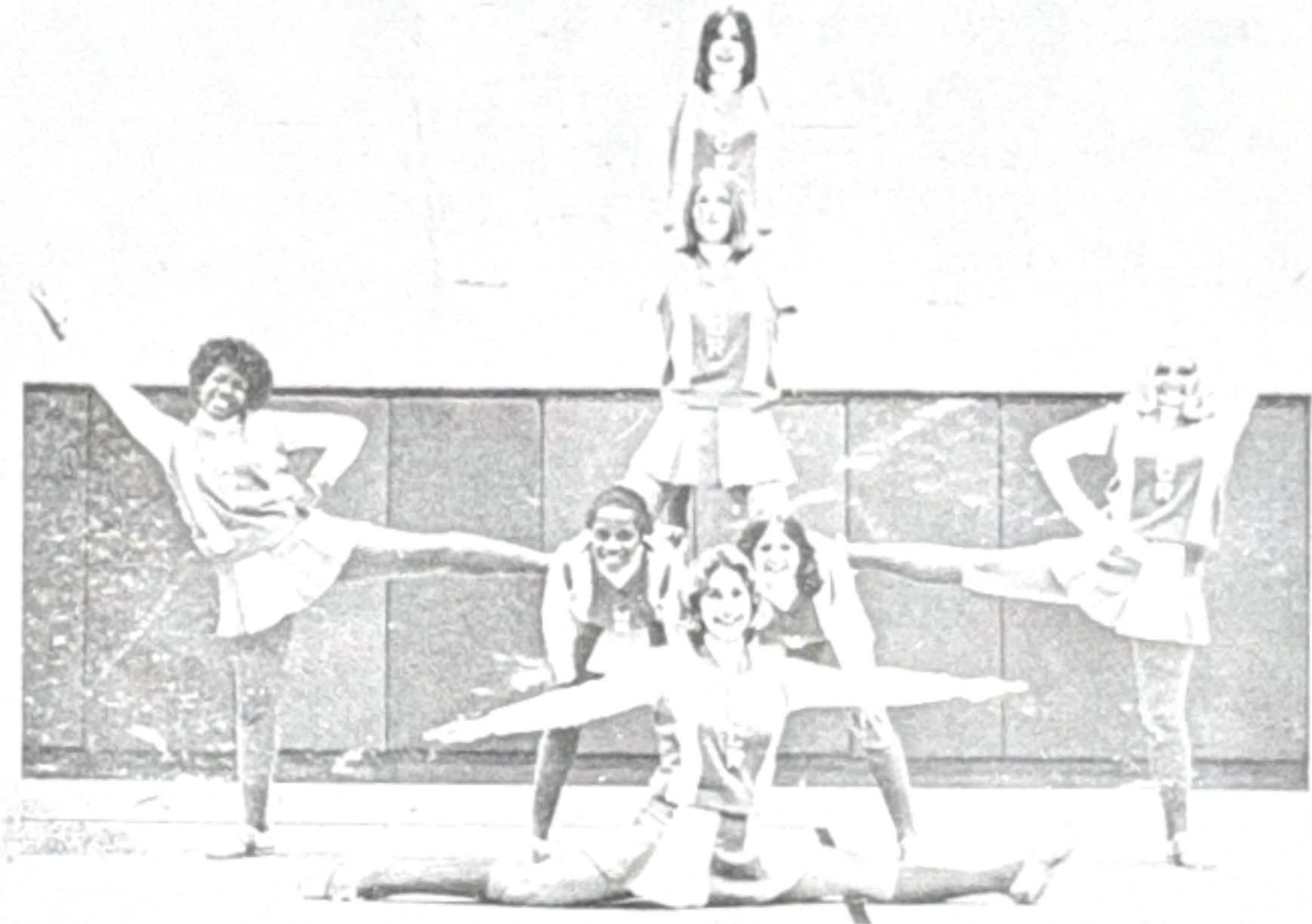
GRAND CHAMPION VARSITY CHEERLEADERS (Second Consecutive Year)