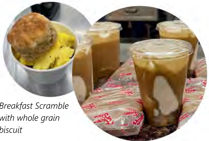
Breakfast Scramble with whole grain biscuit