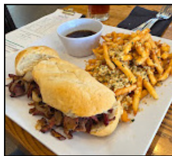
French dip and garlic fries

They also offer board games that you can play with your family or friends. In the summer, they have cornhole out in the grass where you could play with family.