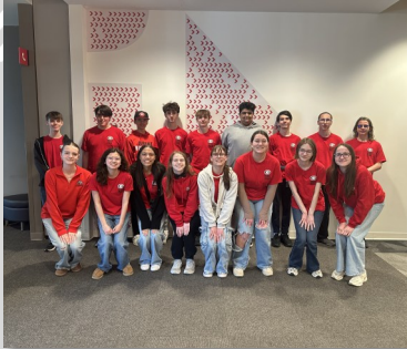
Math Team at State