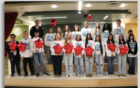
State-Bound FBLA Members

Congratulations to all of our Business Bulldogs on an outstanding performance, and best of luck to our national qualifiers as they prepare for San Antonio in June!