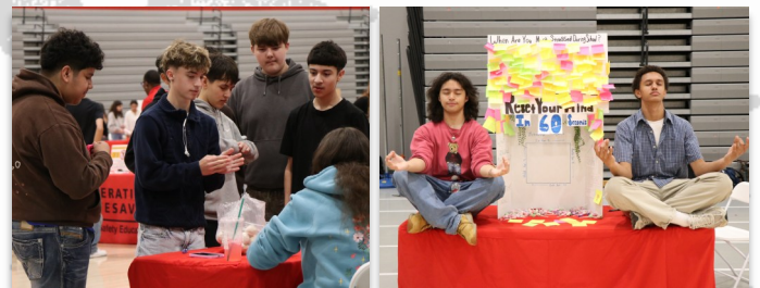
Students participate in our annual Wellness Fair.

We held our annual Wellness Fair last month, with students leading the charge in promoting healthy habits. From showcasing the benefits of flavored water to raising awareness about the dangers of opioids and alcohol, students created engaging, informative stations for their peers. This peer-led event encouraged Bulldogs to take an active role in their well-being and highlighted the importance of making informed, healthy choices.