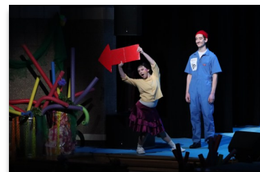
The SpongeBob Musical Narrator