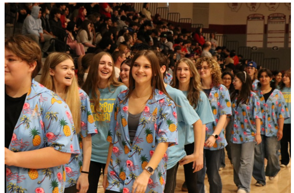
The SpongeBob Musical Cast & Crew