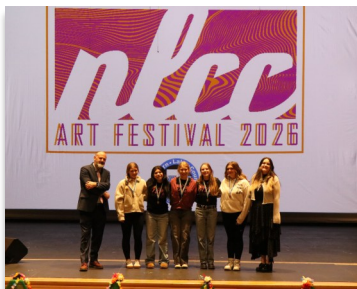
GCHS Distinguished Artists