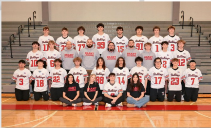
GCHS Varsity Lacrosse Team

Thank you to the Stanton students and staff for your support and for making a difference on our campus!