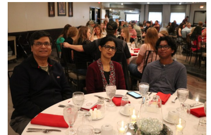
Freshmen and their families celebrate at Freshman Honors Breakfast.

Summer Camp Registration is now available online! When registering online, you can select your desired camp, fill in the appropriate information for your student, and click 'add to cart'. You will use your current RevTrak account, or create an account if you are a new user.