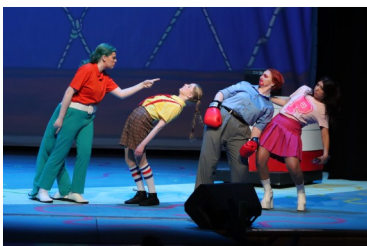
Squidward, SpongeBob, Mr. Krabs, & Pearl