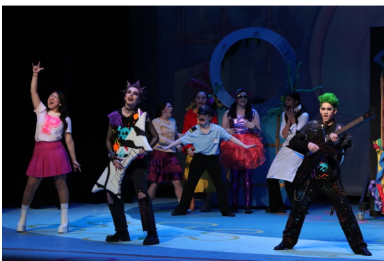
The Electric Skates Perform

Bravo to the entire cast, crew, and directors on a wildly successful run of The SpongeBob Musical , and thank you to the community for packing the house for all three performances!