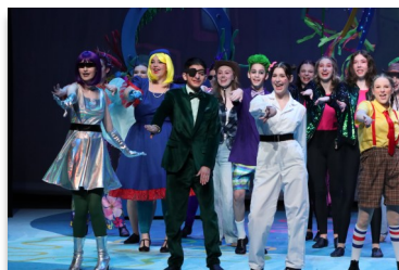
Bikini Bottom Residents

Bravo to the entire cast, crew, and directors on a wildly successful run of The SpongeBob Musical , and thank you to the community for packing the house for all three performances!