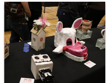
Art Created by GCHS Artists

Thank you to everyone who came out to support our artists and celebrate their hard work. We can't wait to see what our talented students create as the semester continues!