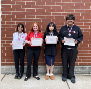
FCCLA Members at State