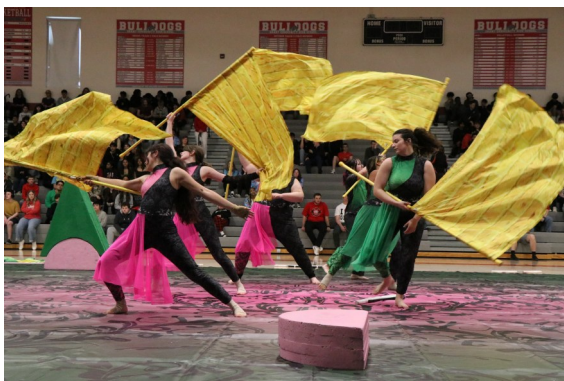
Color Guard performs.