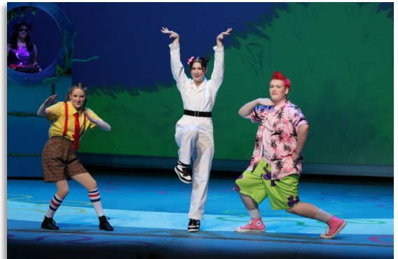
SpongeBob, Sandy, & Patrick

The show featured standout musical moments and high-energy performances across the board, showcasing both vocal talent and creative choreography. From comedic chaos to emotional ballads, the cast brought depth and personality to each role while delivering a production that kept audiences engaged from start to finish.