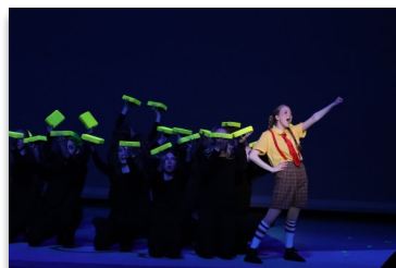
SpongeBob & Sponge Crew