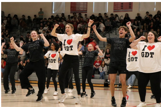
Staff Appreciation Dance with the Grant Dance Team