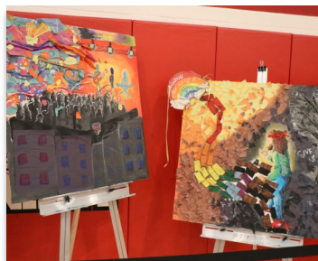
NLCC Art Show—Collaborative Work