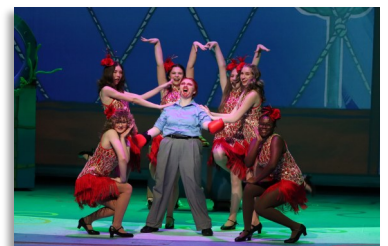
Mr. Krabs & Dancers