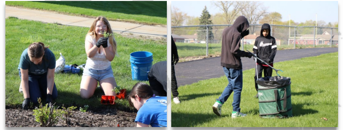
Stanton students donate their time to help clean up the GCHS campus.

As part of their recent Day of Service , students from Stanton spent time helping clean up Grant's campus, demonstrating the value of service, teamwork, and community involvement. Their efforts helped beautify outdoor spaces around the school while making a positive impact that students and staff alike will appreciate.