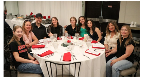
Freshmen and their families celebrate at Freshman Honors Breakfast.