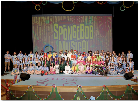
The SpongeBob Musical Cast & Crew

Grant's production of The SpongeBob Musical made a huge splash, with all three performances selling out and audiences filling the auditorium for a vibrant, high-energy trip to Bikini Bottom. The show brought Stephen Hillenburg's beloved animated world to life in a neon-drenched, fast-paced stage production filled with humor, heart, and nonstop creativity.