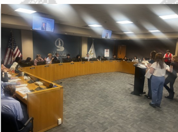
Students participate in the youth advisory council.

Several Grant students recently participated in State Senator Craig Wilcox's Youth Advisory Council , gaining firsthand experience in civic engagement and public policy discussions.