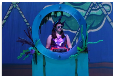
The SpongeBob Musical DJ