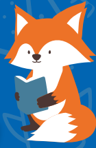
Chart Your Reading Journey!

For every 20 minutes you spend on the court with a book, mark a basketball on your tracker. How many points will you put on the board this summer?