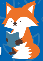
Chart Your Reading Journey!

For every 20 minutes you spend on the court with a book, mark a basketball on your tracker. How many points will you put on the board this summer?