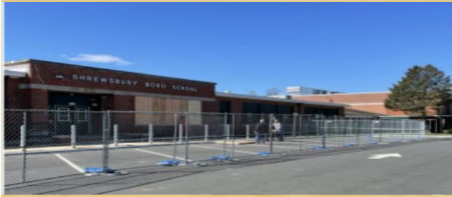
Construction fencing and site preparation are underway at the school's primary entrance.