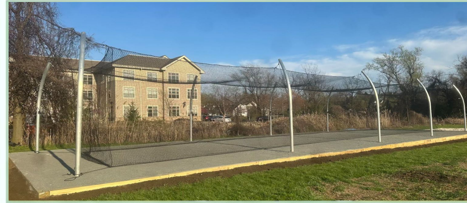
High-profile safety netting has been installed to secure outdoor recreational and sports areas.