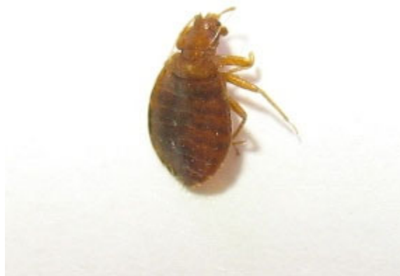
Bed Bugs: Photo by nobugsonme on August 7, 2007