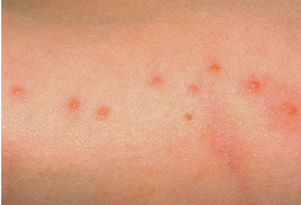
Photo of bedbug bites.