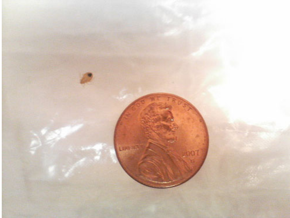
Bed Bugs: Photo by nobugsonme on August 7, 2007