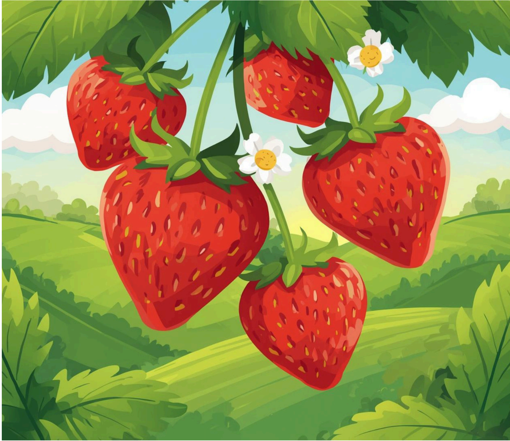
Fresh strawberries are in season during May!