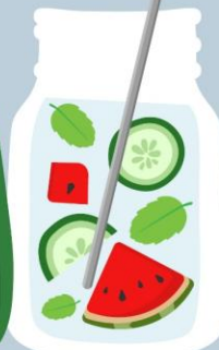
WATERMELON + CUCUMBER + MINT