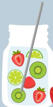
STRAWBERRY + KIWI + LIME