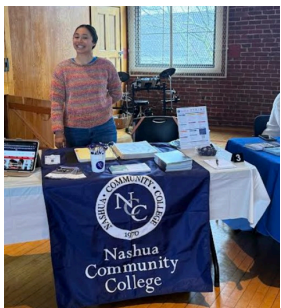
Nashua Community College