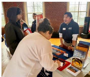
Salem State University