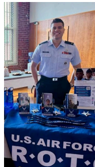
U.S. Air Force