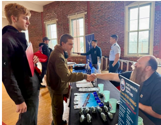
Students were very drawn to this site