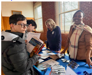
Shriver Job Corps