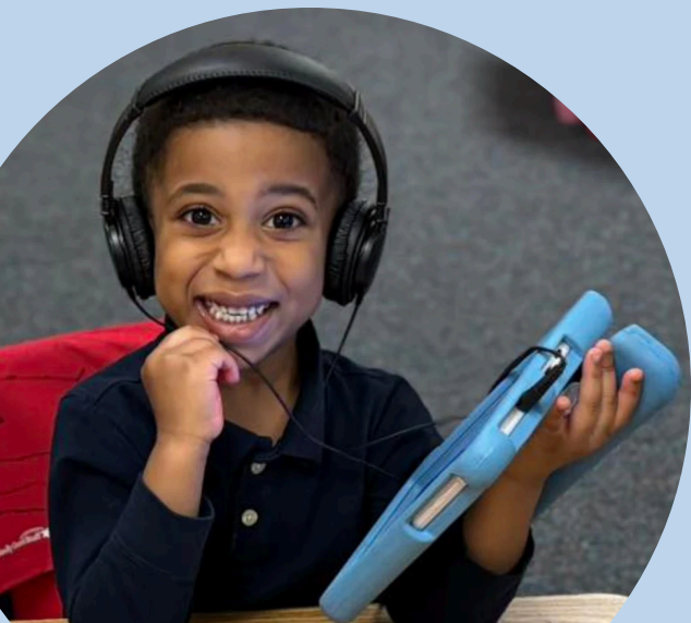
FES i-Ready ELA and Math EOY (2025 vs. 2026)

Grade Levels: 3K - 6th Student Enrollment: 402 School Colors: Solid Navy Blue, Royal Blue and Red School Mascot: Stingray