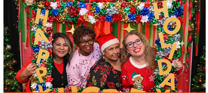
HCDE leaders host festive holiday parties in December at the Irvington and NPO locations to show gratitude and urge employees to rest during winter break.

new goals that continuously push #TeamHCDE to excellence. Finally, the festive holiday parties in December are another show of gratitude for staff dedication and an opportunity for leaders to urge employees to rest throughout the winter break.