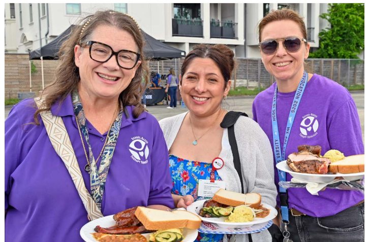
For divisions like School-Based Therapy Services and Head Start, where employees serve at various campuses, Picnic in the Parking Lot is one of the few times colleagues are together to connect.