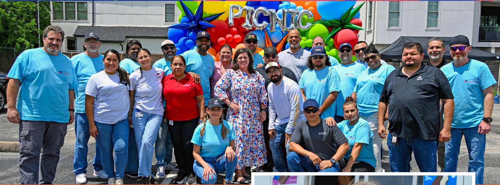
Harris County Department of Education's Facilities team poses for a photo at Picnic in the Parking Lot on April 23.