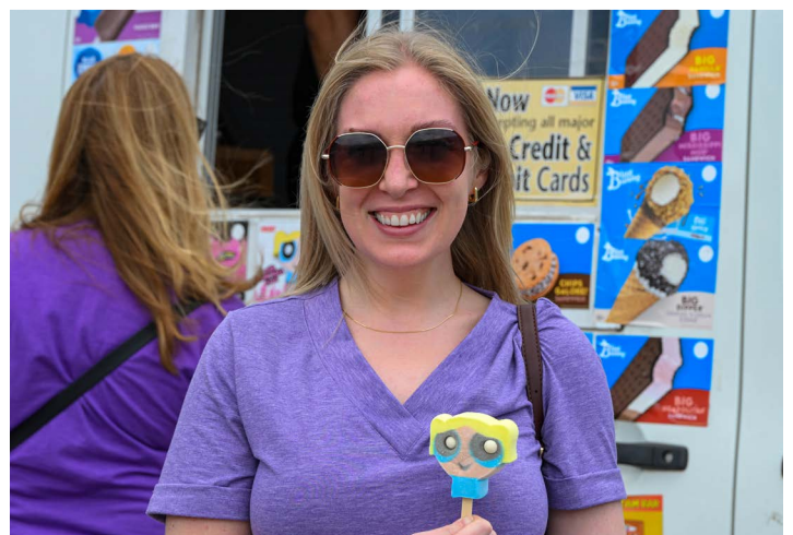
Employee appreciation events like Picnic in the Parking Lot allow employees to fellowship over good food and cool treats.