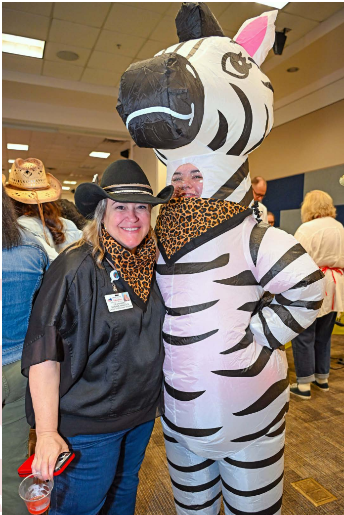
At the annual Chili Cook Off, many staff members dress to impress while others compliment their division's theming.

helped prospective students identify which program they wanted to enter and obtain the necessary documentation.