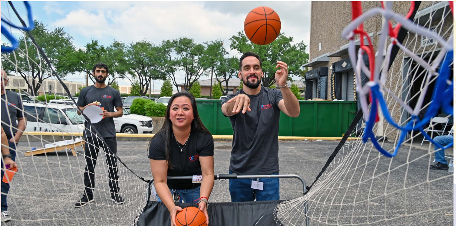
Picnic in the Parking Lot features plenty of games and friendly competition among staff. This year even included dominoes, Jenga and classic card games.