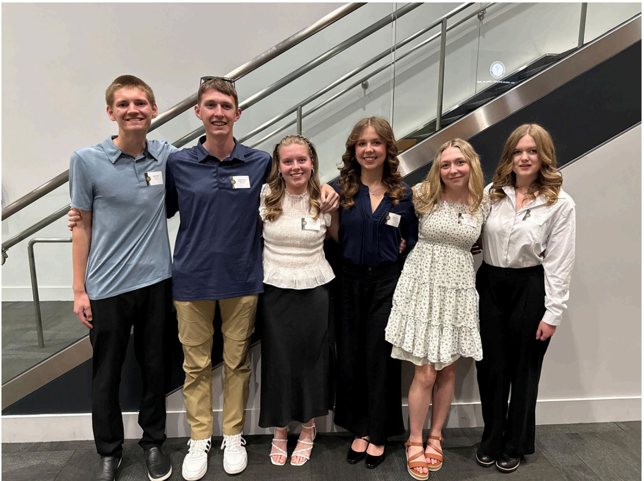
Freeman Spokane Scholar Nominees