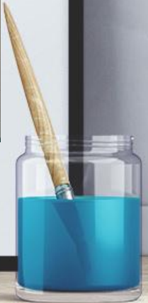
Staff appreciation & capital projects