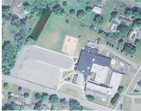
WHITEHOUSE SCHOOL Photovoltaic Power System 171.60 - KW DC