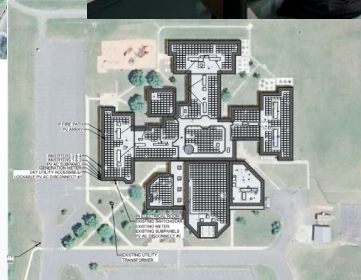
HOLLAND BROOK SCHOOL 531.075 kW DC 440.000 kW AC Photovoltaic Power System