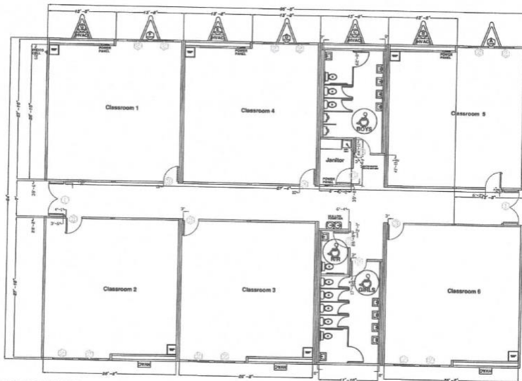
Owner-furnished concept image for a six-classroom layout with central restrooms; reference only, not for scale.