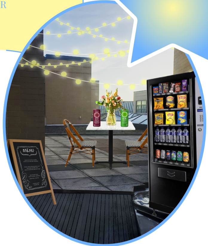
The rooftop restaurant on Friday night.

Overall, this is an opportunity for students to socialize, get some fresh air, and feel more refreshed stepping out to enjoy their meal!