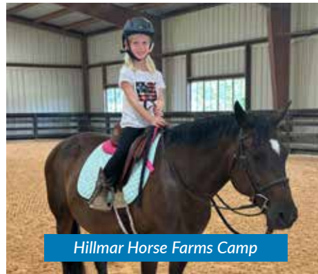
Hillmar Horse Farms Camp