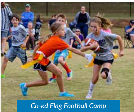
Co-ed Flag Football Camp