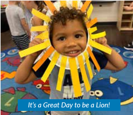
It's a Great Day to be a Lion!