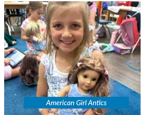
American Girl Antics