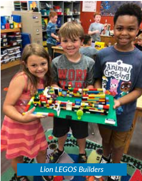
Lion LEGOS Builders