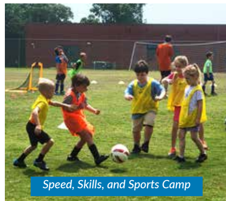
Speed, Skills, and Sports Camp