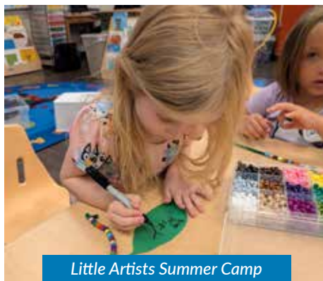
Little Artists Summer Camp