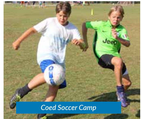
Coed Soccer Camp