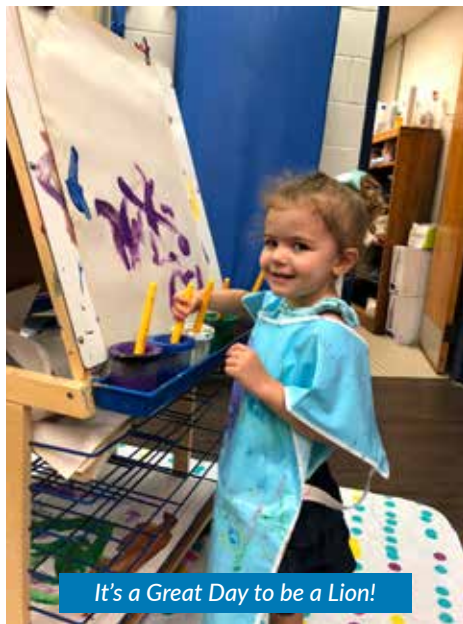
It's a Great Day to be a Lion!