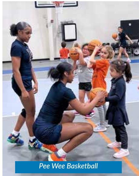
Pee Wee Basketball