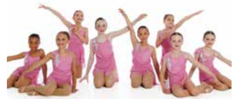
Lakeview Fusion Dance Camp