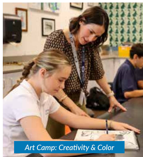
Art Camp: Creativity & Color