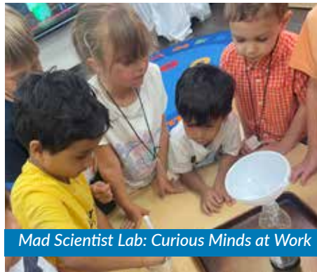
Mad Scientist Lab: Curious Minds at Work