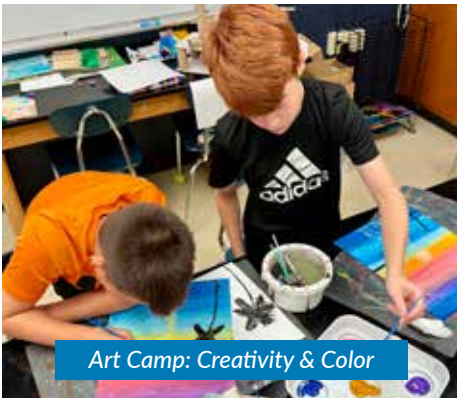
Art Camp: Creativity & Color