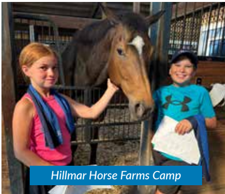
Hillmar Horse Farms Camp