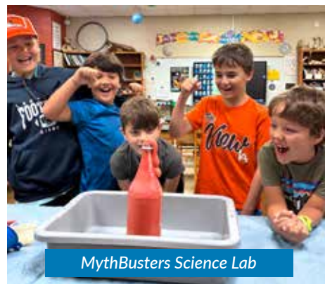
MythBusters Science Lab