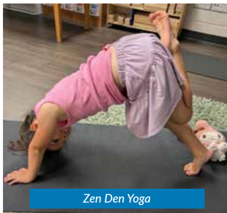
Zen Den Yoga