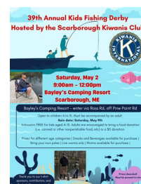
Kiwanis Club's Kids Fishing Derby

Please access this link to the Community Bulletin Board for information about great community events and fundraisers going on in Scarborough.