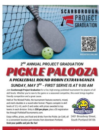
Project Graduation Pickle Ball