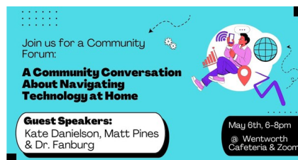
BoE Community Forum