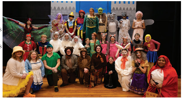
The Fort Edward Drama Club delivered a high-energy performance during their recent production of Shrek the Musical. The fairytale showcase drew a packed house to the high school auditorium for a weekend of music and comedy.

Our proposed budget reflects a deep commitment to operational efficiency, coming in nearly $70,000 below the current school year's operating budget. This reduction