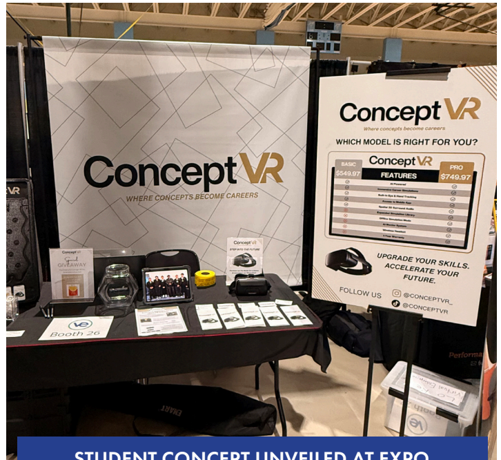
STUDENT CONCEPT UNVEILED AT EXPO

Additionally, both firms ranked in the top percentile nationwide in the Elevator Pitch Competition. Concept VR was named a Top 50 firm in the Northeast Region for the Business Plan Competition, and students participated in multiple trade shows where they refined their sales and networking skills. The program continues to equip students with essential real-world experience, strengthening their leadership abilities, confidence, and professional communication skills in preparation for college and future careers.