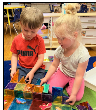
Left: Preschool class at recess, Center and Right: Pre-Kinder class learning through hands-on activities.