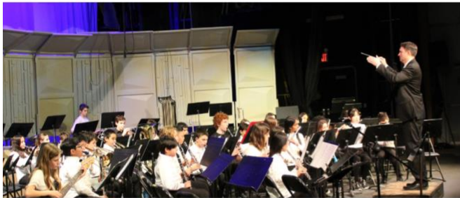
Blind Brook Middle School