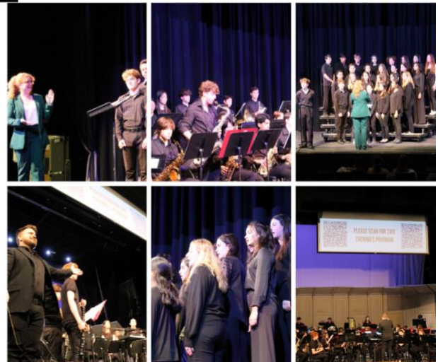
Blind Brook High School