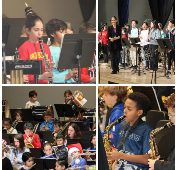
BMPRSS 5th Grade Band