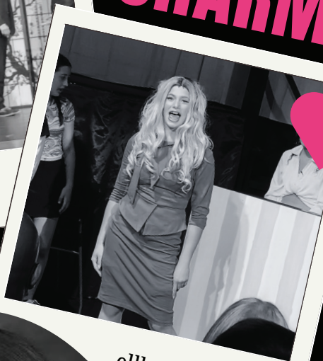
elle woods, 2022