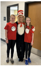
Thing One and Thing Two Day