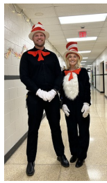
Dr. Seuss is in the House!