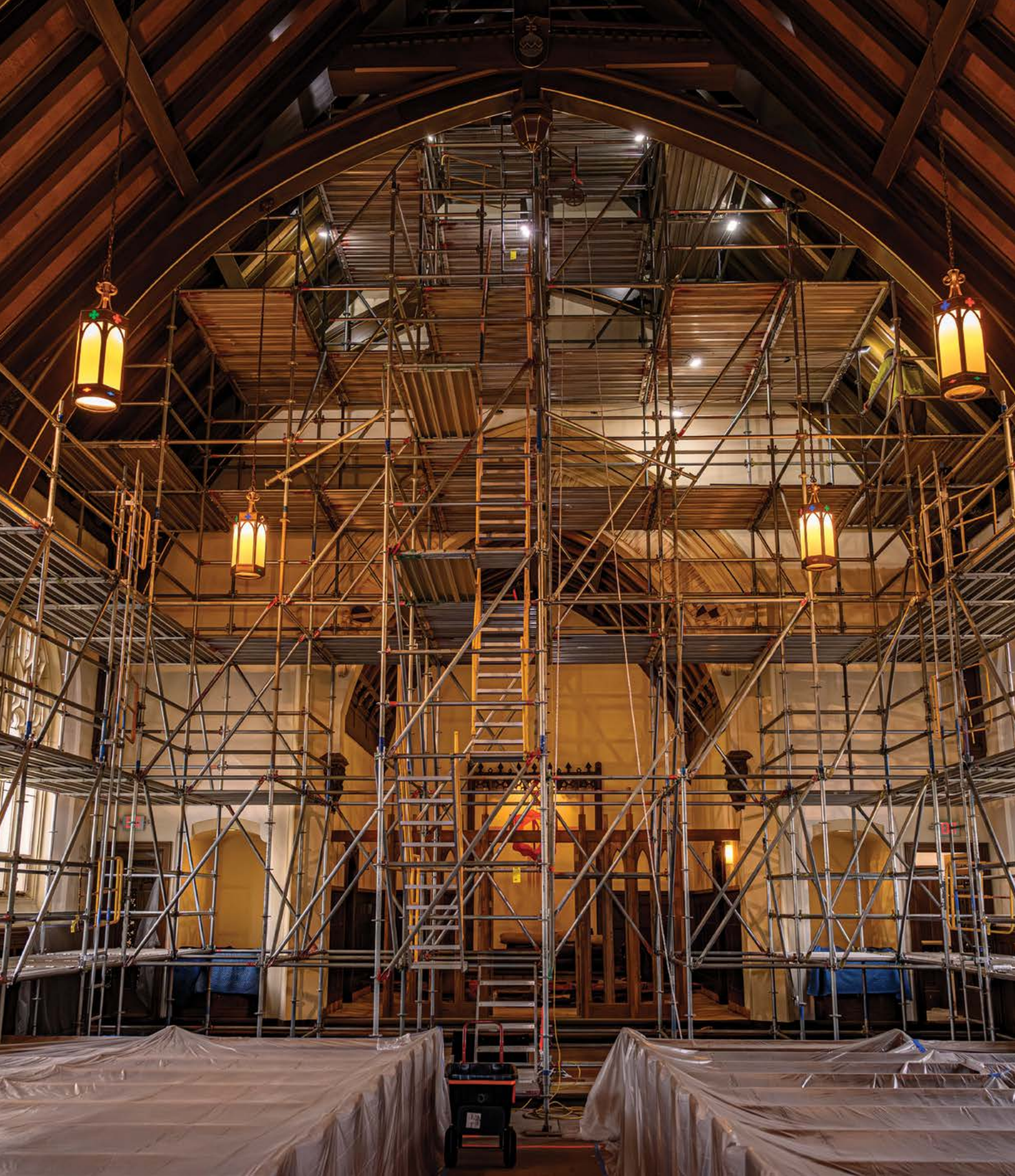
Our historic St. John the Evangelist Chapel is more beautiful than ever after undergoing significant repair work in 2025-2026. Important renovations included: replacement of select exterior roof tiles, plaster repair, painting, select