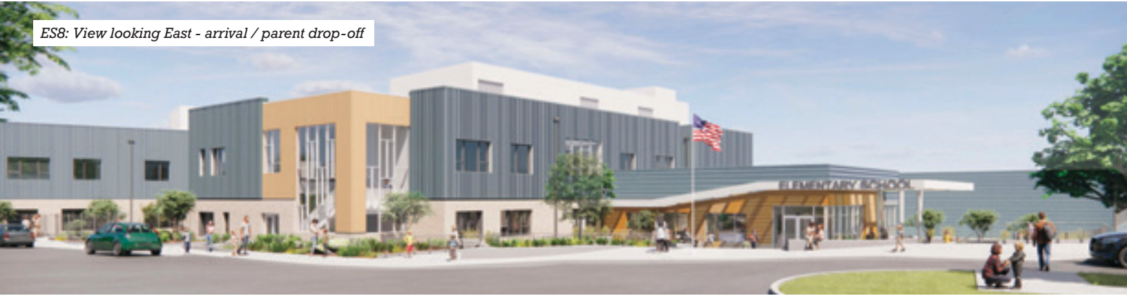
ES8: View looking East - arrival / parent drop-off

Exciting progress continues across the Lake Stevens School District as our voter-approved School Construction Bond projects move from planning to reality. These investments are creating safe, welcoming, and future-ready learning environments designed to serve students and our growing community.