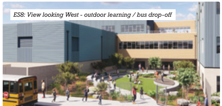
ES8: View looking West - outdoor learning / bus drop-off