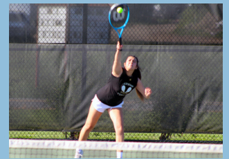
Lakewood's tennis courts are available to individuals after school until dusk. For group reservations, visit our Facilities website.

Enjoy the views from the LHS tennis courts or relax while walking the cross-country trail near English Crossing. And don't forget our playgrounds for families. As we