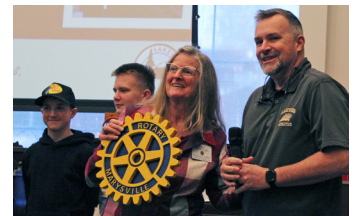
The LMS STEM Lab made a custom Rotary Wheel using the new laser cutter that they presented during the meeting.

Other projects have included traffic lights, railroad crossings, and other moving miniatures.