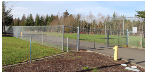
Thank you, voters! Cougar Creek Elementary now has a new layer of safety. Crews completed the security fencing around the school's play field and playground.

Lakewood School District has received a $600,000 urgent repair grant from the Office of Superintendent of Public Instruction (OSPI) to replace Lakewood Elementary's outdated boiler system. The upgrade will include two commercial-size boilers and heat pumps.