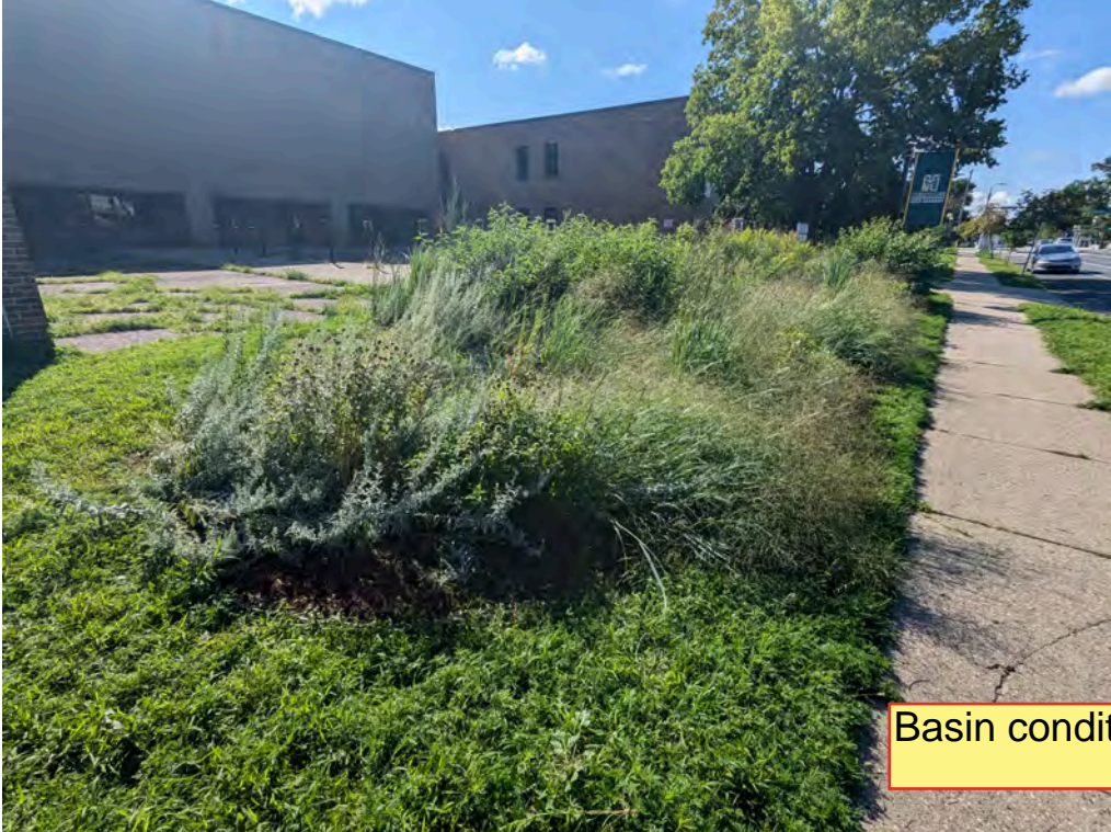
Basin condition in August