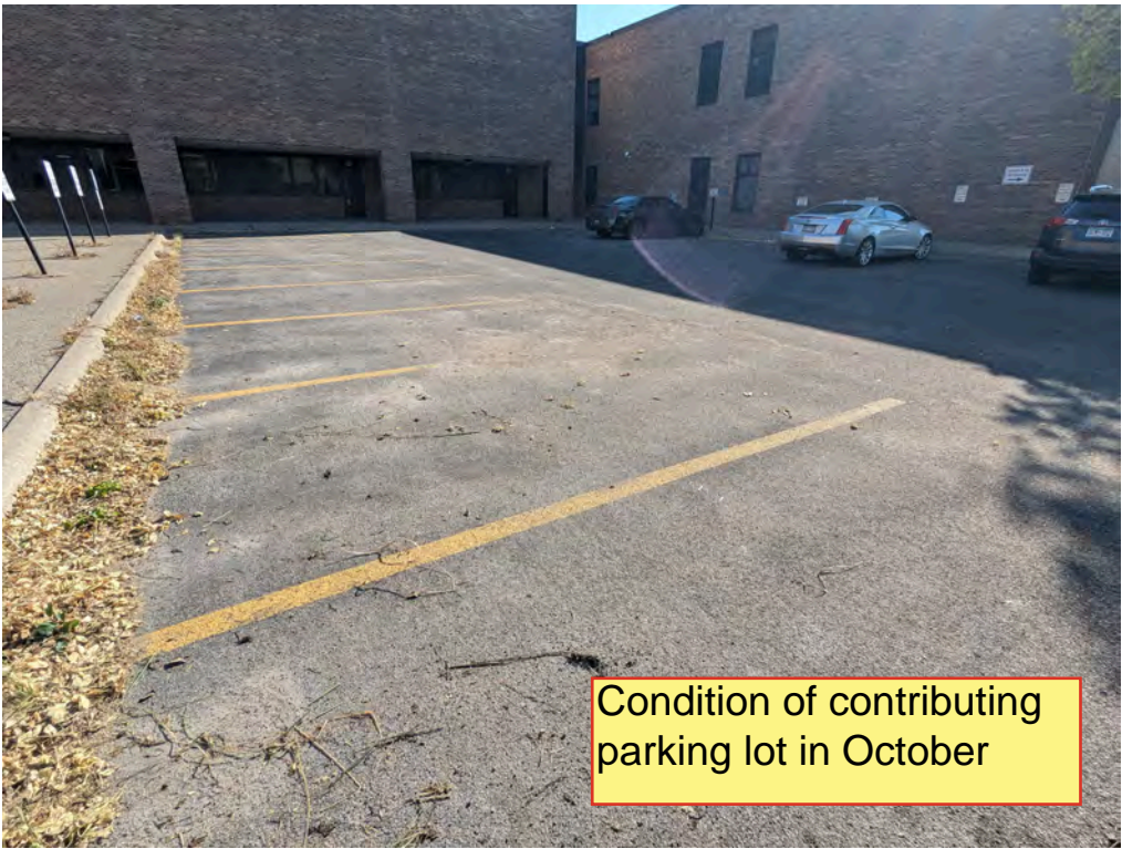
Condition of contributing parking lot in October