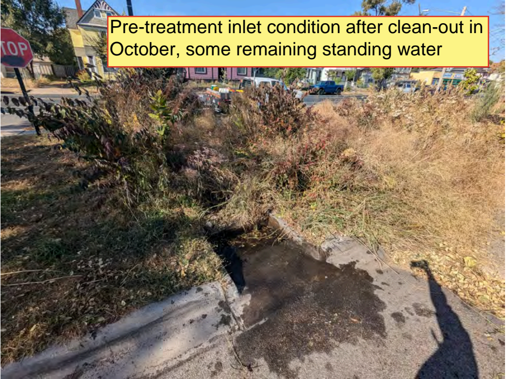
Pre-treatment inlet condition after clean-out in October, some remaining standing water