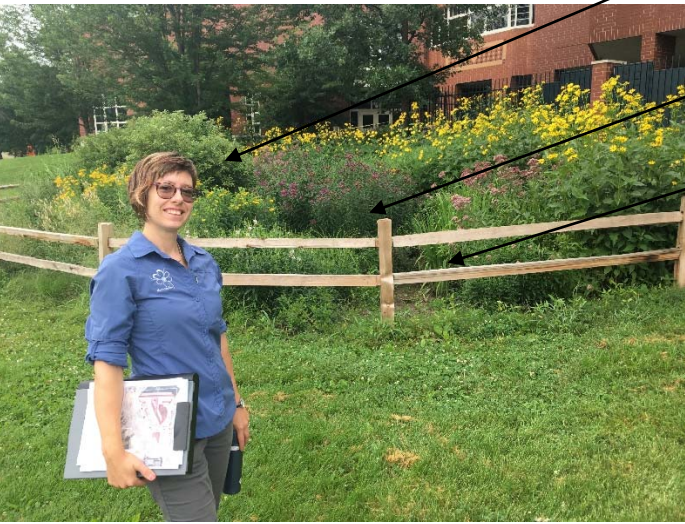
Metro Blooms Inspector