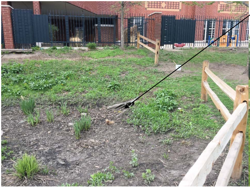
Inlet from parking lot