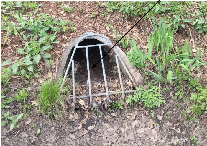
Inlet from Roof