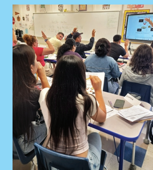
English as a Second Language